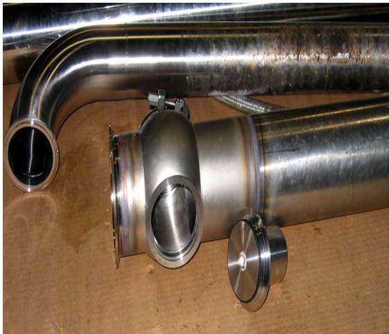
Sensor and Varivent fitting prior to installation

Function: Infrared detector for dissolved Brix, sends data to SMS, high speed sampling with .01 Brix resolution 1 mBrix resolution