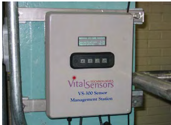
VS-300 Sensor Management Station

The VS-300 Software has both offset and gain correction available so that the sensor can provide data relative to a customer's historical methods and process analysis database.