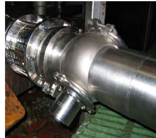
Sensor installed in finished pipe