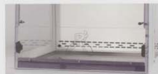
Clear interlocked removable door for safe automatic sterilisation