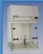
Filtration Fume Cupboards

Other products in the Labcaire range include: