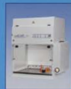
Microbiological Safety Cabinets