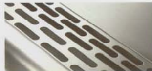
Unique Grille Configuration

Containment and laminar flow are achieved with the use of HEPA (High Efficiency Particulate Air) filters making the cabinet easy to install as no connection to services are required, other than mains electricity.